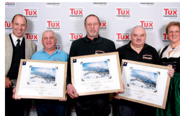
60, 70 and 80 times in the Tux Valley: Die Skifreunde Pinzger