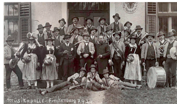
Finkenberg Town Band today (left) and at the founding ceremony one hundred years ago (above).