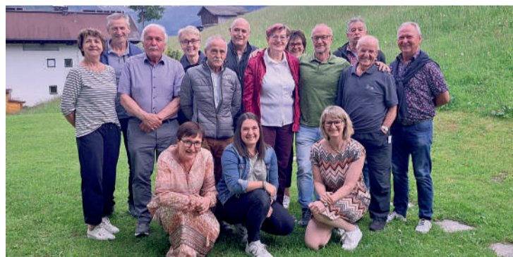
The association's volunteer drivers are on the road from Monday to Friday between Tux-Vorderlanersbach and Hintertux.