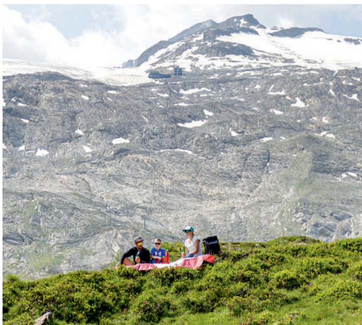
A picnic in the middle of the green alpine meadows gives body and soul the right energy and „motivation to continue hiking“.

DELICIOUS CONTENTS. The rucksack is equipped with a picnic blanket, comfortable cushions, cloth napkins, cutlery and regional delicacies such as Zillertal smoked bacon, hay milk cheese, spreads and delicacies such as tomato mozzarella, vegetable sticks