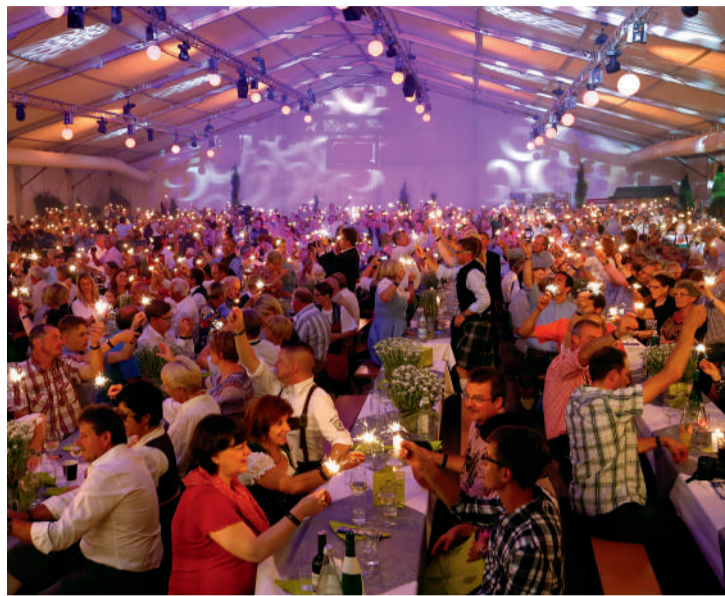
From the festive opening to the glamorous gala evening in the marquee to celebrate the event's conclusion - the Regular Guest Week anniversary will once again be one of the best holiday weeks for our many regular guests, with a variety of great and entertaining experiences.