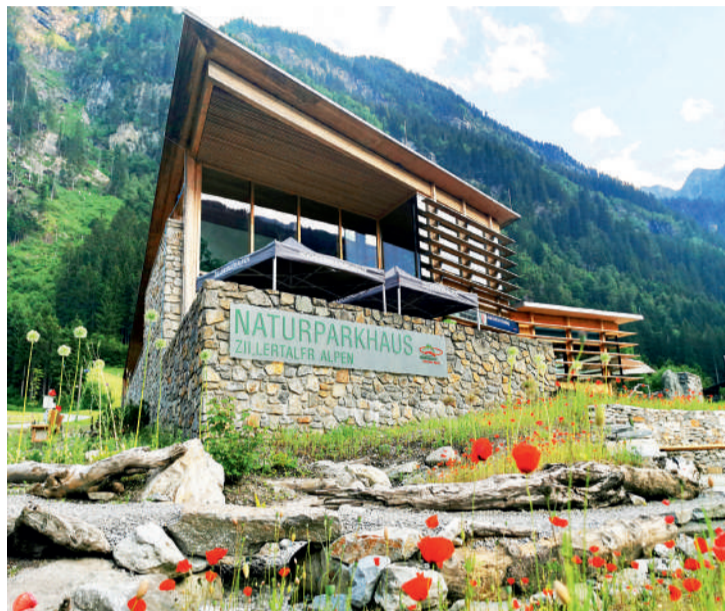
As part of school projects, over 6,000 native plants and mountain flowers were planted around the new Nature Park House in Ginzling.

GEOLOGICAL HIKING GUIDE. The Zillertal and Tux Alps are one of the most geologically fascinating and complex areas in the Alps. Due to its location in the western sector of the so-called „Tauern Window“, the region is regarded by scientists as a hot spot for geological research. Those interested can also go on a voyage of discovery in the Nature Park. The hiking guide,