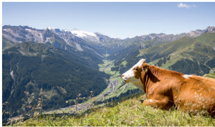
Immerse yourself in the magnificent mountain world of the Tux Valley and allow yourself to be swept away by the veritable plethora of leisure opportunities!

T he hiking paradise of Tux-Finkenberg offers incredibly “high spirits”. Feel the positive power of the clear mountain air during an easy hike to a mountain hut, or a more challenging summit tour where crystal-clear mountain lakes, stupendous waterfalls and unique flora and fauna await. Your mountain adventure in Tux-Finkenberg is surrounded by the peaks of the Tux Alpine panorama.