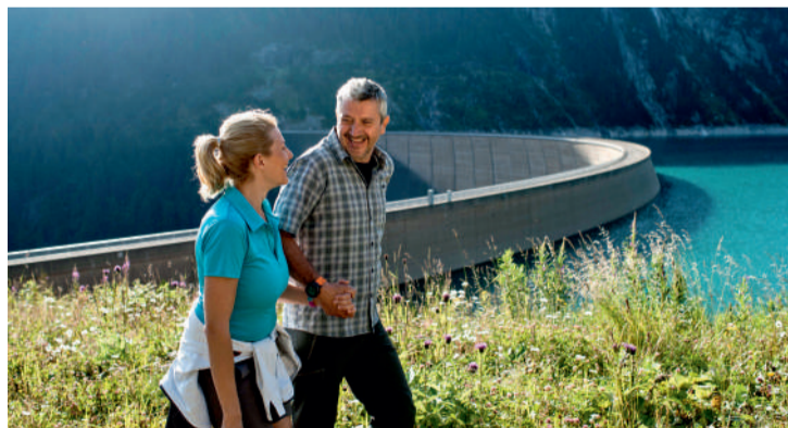
Schlegeis reservoir is a popular excursion destination and starting point for hikes to the surrounding mountains and huts.

SCHLEGEIS DAM. Schlegeis reservoir dam wall is a technical masterpiece. Favourable geological conditions made it possible to build a 131-metre-high, double curvature arch dam, with an unusually long crest length of 725 metres, which required the use of almost one