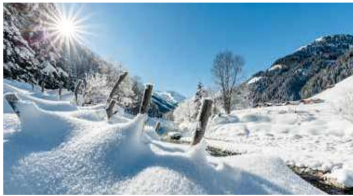
Winter in the Tux Valley: thanks to optimal altitudes of 850 to 3,250 m, snow is guaranteed one hundred percent from October through to May!

S now-capped mountains, forests swathed in deep snow, pristine slopes and a distinctive winter landscape - the high valley with its villages of Finkenberg, Tux and Hintertux with the Hintertux Glacier is every winter-lover's dream and guarantees countless winter adventures.