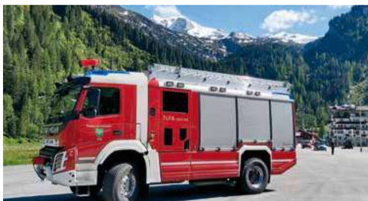
Tux Voluntary Fire Brigade's new TLFA 3000/100 fire-fighting vehicle is perfectly tailored to the requirements of the glacial valley.

HIGH REQUIREMENTS. "Two years of intensive preparation were necessary in order to find the optimum emergency vehicle for our special requirements," reports Benjamin Stöckl, Deputy Commander of Tux Volunta-