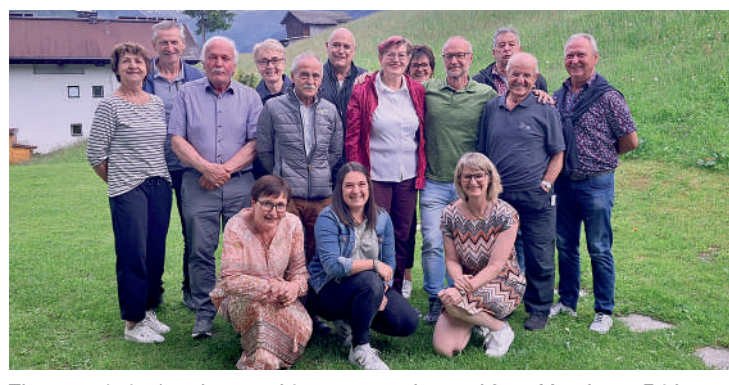
The association's volunteer drivers are on the road from Monday to Friday between Tux-Vorderlanersbach and Hintertux.

Meals are adapted to individual requirements for those in need of a special diet.