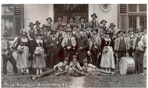
Finkenberg Town Band today (left) and at the founding ceremony one hundred years ago (above).