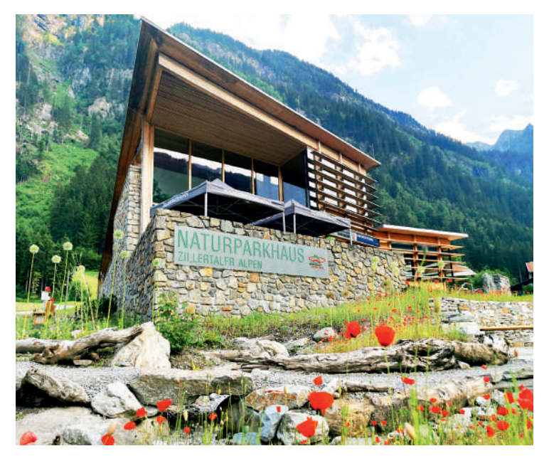
As part of school projects, over 6,000 native plants and mountain flowers were planted around the new Nature Park House in Ginzling.

GEOLOGICAL HIKING GUIDE. The Zillertal and Tux Alps are one of the most geologically fascinating and complex areas in the Alps. Due to its location in the western sector of the so-called "Tauern Window", the region is regarded by scientists as a hot spot for geological research. Those interested can also go on a voyage of discovery in the Nature Park. The hiking guide,