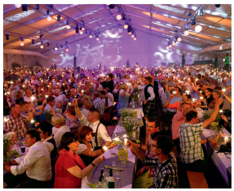
From the festive opening to the glamorous gala evening in the marquee to celebrate the event's conclusion - the Regular Guest Week anniversary will once again be one of the best holiday weeks for our many regular guests, with a variety of great and entertaining experiences.