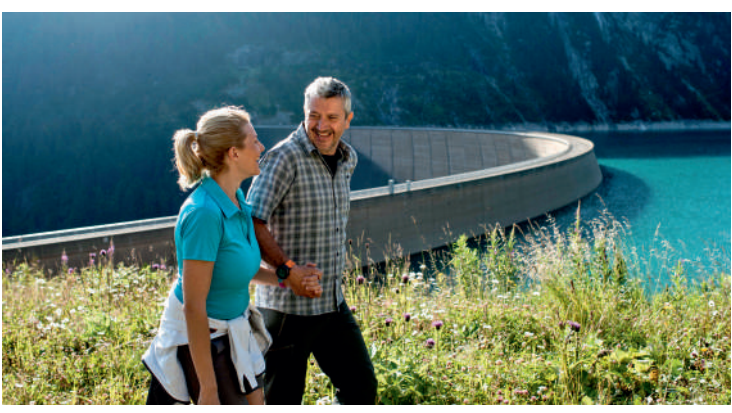
Schlegeis reservoir is a popular excursion destination and starting point for

SCHLEGEIS DAM. Schlegeis reservoir dam wall is a technical masterpiece. Favourable geological conditions made it possible to build a 131-metre-high, double curvature arch dam, with an unusually long crest length of 725 metres, which required the use of almost one