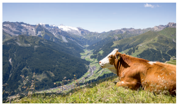
Immerse yourself in the magnificent mountain world of the Tux Valley and allow yourself to be swept away by the veritable plethora of leisure opportunities!

BIKE & HIKE. The combination of (e-)mountain biking and hiking offers a unique opportunity to experience the beauty of nature at your own pace. You first enjoy a leisurely ride up the mountain pastures with your e-mountain bike, before continu-