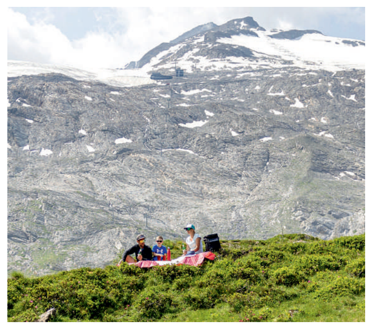
A picnic in the middle of the green alpine meadows gives body and soul the right energy and "motivation to continue hiking".

DELICIOUS CONTENTS. The rucksack is equipped with a picnic blanket, comfortable cushions, cloth napkins, cutlery and regional delicacies such as Zillertal smoked bacon, hay milk cheese, spreads and delicacies such as tomato mozzarella, vegetable sticks