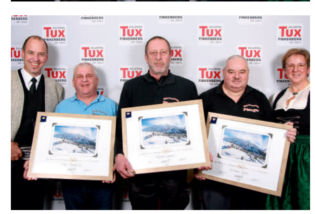
60, 70 and 80 times in the Tux Valley: Die Skifreunde Pinzger