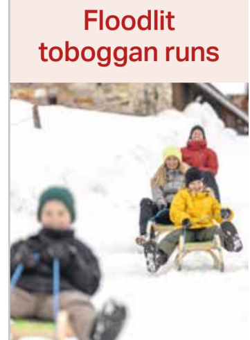
Floodlit toboggan runs