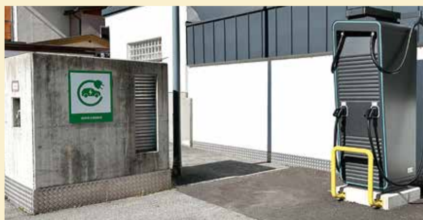
The hyper-charger at Tux-Center in Tux-Lanersbach has two charging points.

ensuring stress-free travel for their guests. Publicly accessible charging stations, however, are also well distributed throughout the Tux Valley. For example, eight charging points are available alongside the new „Aue“ underground car park at the Hintertux Glacier valley station. The wall boxes are equipped with Type 2 (up to 22.2 kW) and Type F plugs. There is an express-charging station (up to 150 kW) with two charging points for all e-cars at the Tux-Center car park in Tux-Lanersbach.