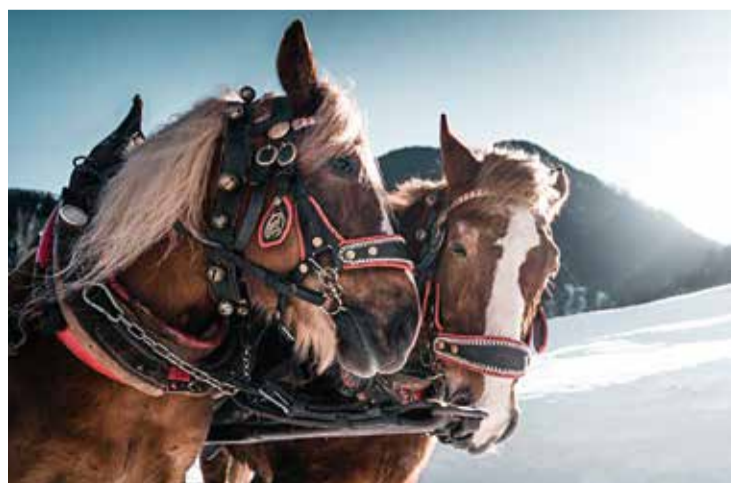
The wintry landscape around Finkenberger Sattel is ideal for a romantic horse-drawn sleigh ride for two.

In winter, the snow-covered landscape around the Finkenberger Sattel has a very special charm for horse lovers, where it forms the enchanting backdrop for a romantic horse-drawn sleigh-ride for two. The coachman and his horse are ready and waiting at the „Finkenberger Sattel“ riding stable near the Finkenberg district of Dornau with a carriage swathed in a waft of nostalgia. Wrapped snugly in warm blankets, passengers are taken through snow-covered forests and treated to views of the majestic peaks of the Zillertal Alps. The