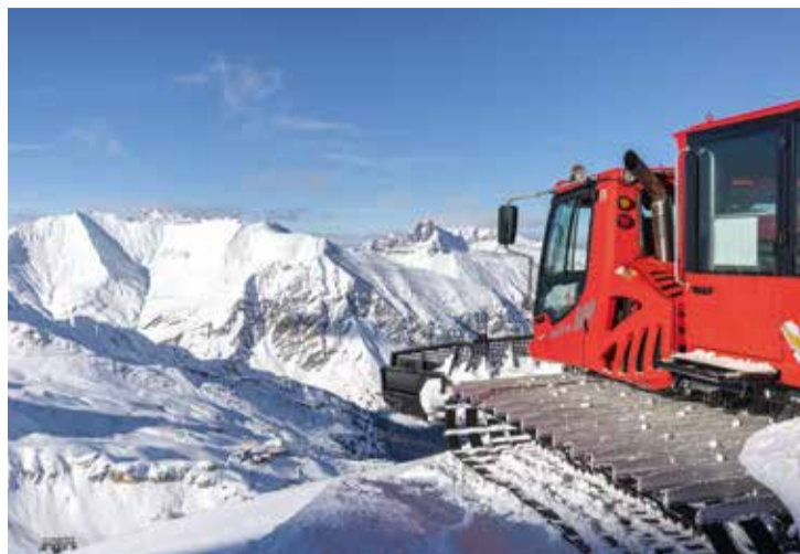
By using HVO fuel, the net emissions caused by fuel at the Hintertux Glacier are reduced by up to 90 %. For example, CO 2 emissions are reduced by up to 94 %.