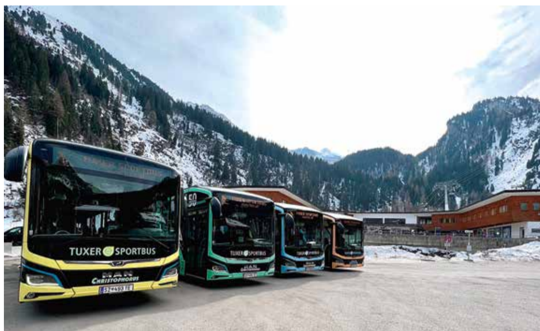
Four electric buses have been in operation on the steep mountain roads in the Tux Valley and up to Schlegeis Reservoir since March 2023. Three more e-buses will be added in winter 2023/24.

The Tuxer Sportbus has ferried skiers and winter sports enthusiasts to the cable car stations and starting points for winter hiking, toboggan and cross-country skiing for the past fifty years. Four electric buses have been in operation in the Tux Valley since March 2023. In winter 2023/24, the entire sports bus fleet will be converted to electric buses which means that the entire Sportbus Tux schedule with its frequent service every ten minutes can now be accommodated by electric buses.