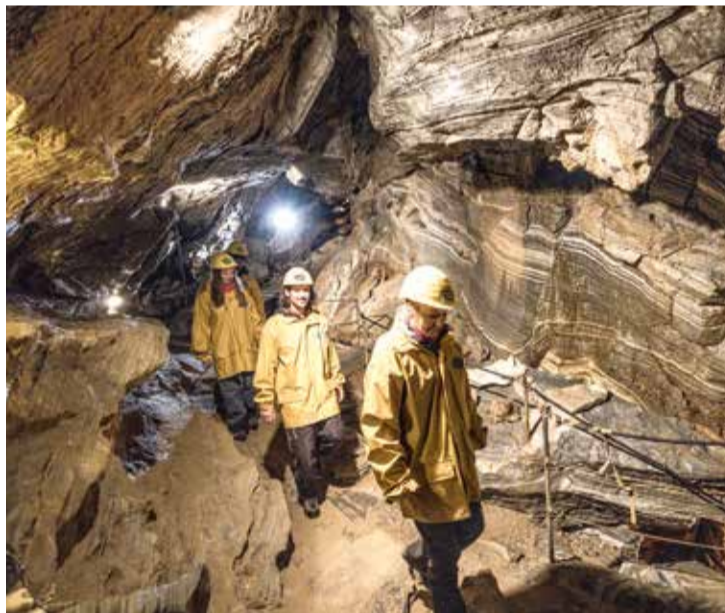
The Spannagel Cave, a unique destination for excursions in all weathers, is offering daily guided tours in winter for the first time this year.

minimise transport routes and thus offer guests high-quality products. For instance, milk and yoghurt are sourced from the Hintertux farming cooperative, bread and pastries from the Stock village bakery in Tux, cheese and dairy products from the Erlebnissenerei Zillertal Dairy, distillates from Schwendberg. "The list is long, and years of effort have now been rewarded with the 'Bewusst Tirol' award (promoting the use of local food in the hotel industry). We are delighted to bring a piece of