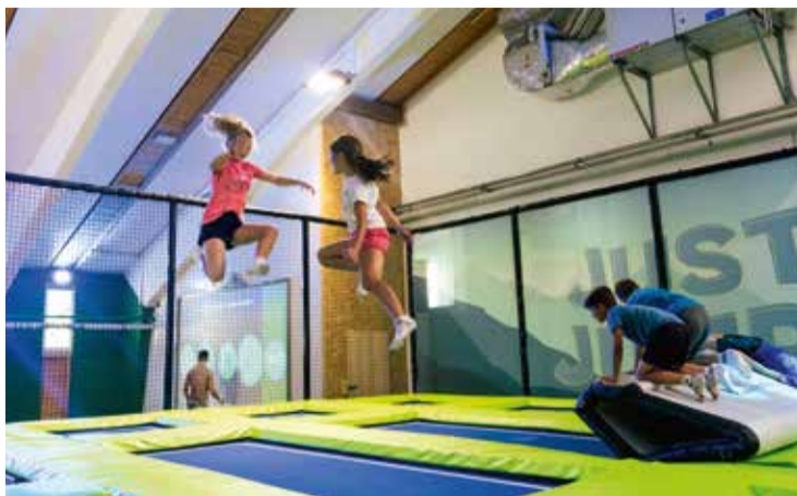
The new trampoline park at Playarena in Tux-Vorderlanersbach offers the best conditions for practising the latest jumping tricks.