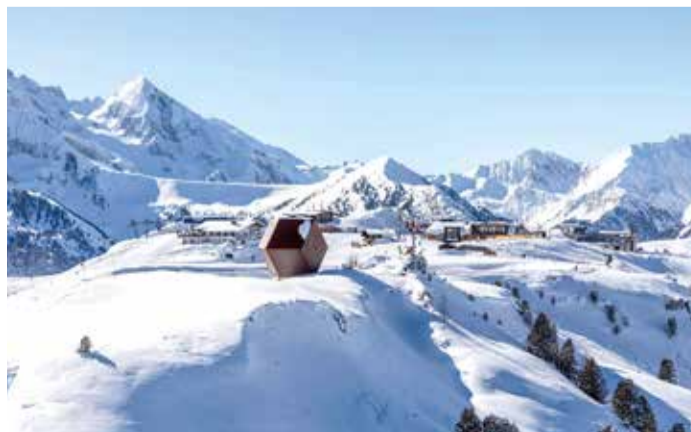
Skiing and winter hiking at Penkenjoch high above Finckenberg

T he BergWaldWeg high above Finckenberg is a special tip for the whole family. While grandma and grandpa enjoy the wonderful view of the mountain world on the cosy hiking trail, the athletes of the family are out and about on the surrounding slopes. Meanwhile, the skiing offspring are having fun in Pepi's Kinderland. Hikers and skiers meet again and again in the ski area. At Penkenjoch, everyone enjoys the unique winter ambience together.