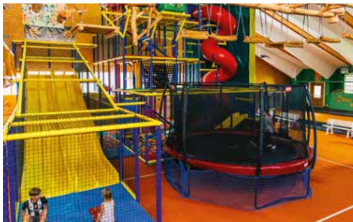
Children can really let off steam in the 1,200m 2 Playarena with indoor and outdoor areas