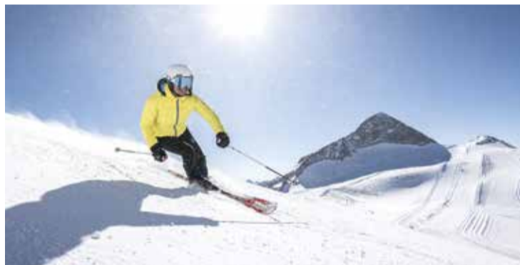
White-capped mountains, forests swathed in deep snow, pristine slopes - that is the essence of winter in Tux-Finkenberg. 100% snow-sure conditions are guaranteed by optimum altitudes of 850 to 3,250 metres above sea level.

The Tux Valley with its villages of Finkenberg, Tux and Hintertux and the Hintertux Glacier at the head of the valley guarantees heaps of snow and fun in winter, ensured by 65 state-of-the-art lifts and over 200 kilometres of slopes in the five ski areas of the Ski & Glacier World Zillertal 3000. Those new to skiing are spoilt for choice with several ski schools. Pepi's Kinderland and Kinderclub at Penkenjoch, Floh-park Hintertux with the cool new „Luis“ snow playground“ and Eggalm Children's Park are ideal for children making their first attempts on skis, while beginners and advanced skiers will enjoy the fun and kid's slopes