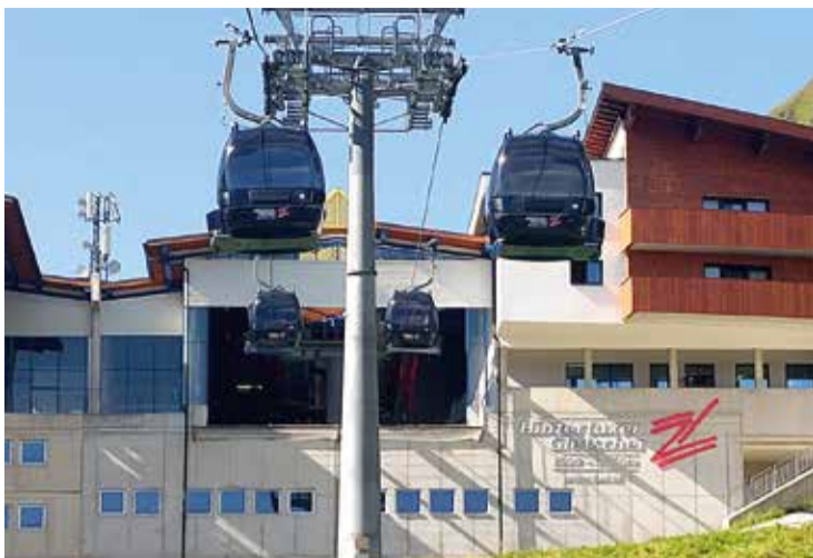
In July, all 57 cabins of the gondola lift of the 8er Sommerberg were replaced. The new gondolas offer more views, comfort and space thanks to the externally mounted ski racks.