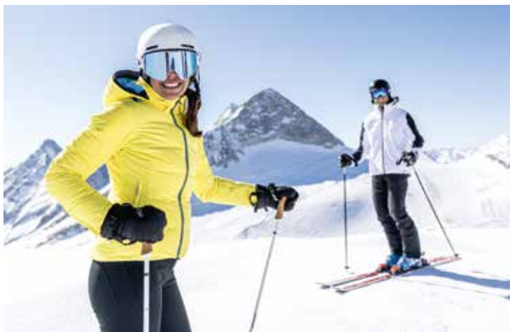
The Hintertux Glacier with guaranteed snow from October to May and breathtaking views of the surrounding three-thousand metre peaks and the striking Olperer summit.

SNOW GUARANTEE. Thanks to the Hintertux Glacier, Tux-Finkenberg is able to offer guaranteed