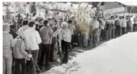
Winter sports enthusiasts from near and far have always been fascinated by glacier skiing.

60 years ago, the five founders of today's Zillertaler Gletscherbahn GmbH & CoKG cable car co. were united by their strong bond with nature and the mountains. Due to the lack of alternative economic opportunities, they decided to invest all their energy into developing the glacier ski area and tourism in order to create a livelihood for their families and the region.