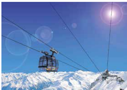
Glacier Bus 3 – the world's highest bicable gondola lift – goes into operation in 2000.

1964 to 2024 were characterized by innovations and responsibility for our living space