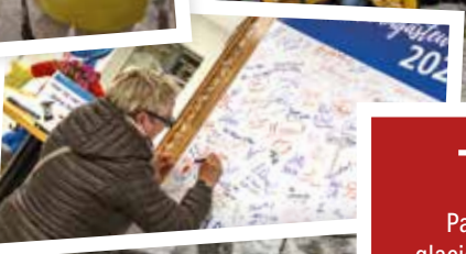
Tuesday, 02.07.2024 Participants were able to take a peek behind the scenes of glacier cable car operations at the Fascination Hintertux Glacier Tour, as well as discover exciting details about technical masterpieces in the high alpine mountain world. Regular guests also learnt lots of interesting facts about the glacier ice and geology of the Tux glacier at Nature's Ice Palace and the Spannagel Cave.