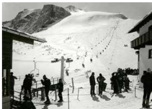
In 1971, the world's first chairlift with supports on glacier ice is built on the Hintertux Glacier.