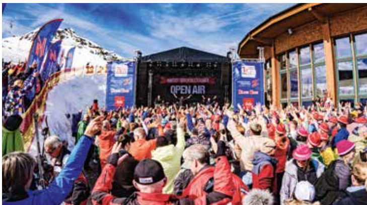
The Cologne Weeks in Hintertux 20th anniversary - this translates into „Rhenish“ joie de vivre, wonderful skiing fun and pure winter romance in the Tux-Finkenbergl holiday domicile.

There is plenty of fun to be had on the natural ice rink in Tux-Lanersbach! No matter whether you venture onto the ice on skates yourself, or prefer to watch the children from the sidelines, great fun is guaranteed. The curling lanes in Tux-Lanersbach also offer entertaining action with long-distance and target shooting.