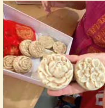
Homemade soaps can be made in different shapes and colours.

For her, the production process begins with the selection of essential oils. 'Each oil or fat has special properties: olive oil makes for a mild, moisturising soap, while coconut oil creates a rich lather,' explains