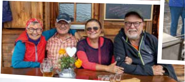
Monday, 01.07.2024 The huts and mountain farms around Tux-Lanersbach invited guests to socialise with culinary delicacies and musical treats at the mountain hiking day at Eggalm.