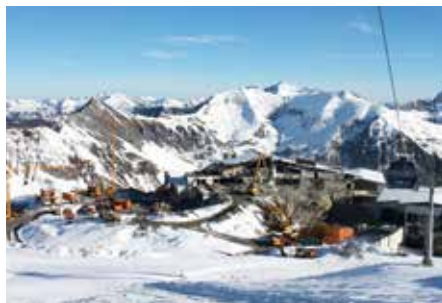
Thanks to ongoing quality improvements the Hintertux Glacier has developed into one of the leading glacier ski resorts in the world. The picture shows the renovation of the Tuxer Fernerhaus in 2013.