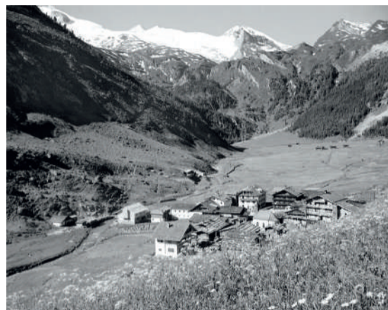
Hintertux as it used to be. The photos from the Tux Chronicle show the village in 1907 (left) and 1935 (right).

From a historical perspective, Bavarian settlers began populating the Tux Valley after the collapse of the Roman Empire and the withdrawal of Roman legions. During this settlement process, which continued well into the seventh century, Germanic law and administrative structures were introduced to the Alpine region. Within the Duchy of Bavaria, the Tux Valley was divided into two districts. The front part became part of the Zillertal district (governed by Salzburg), while the rear section fell to the Wipptal district and thus became part of the County of Tyrol. The entire Hintertux area was subject to a feudal lordship and was administered by the Steinach am Brenner district authority. As a result, the front and rear sections of the Tux Valley developed differently in terms of administration, legal matters, taxation and church organisation. It was not until the 19th and 20th centuries that these systems were gradually harmonised.