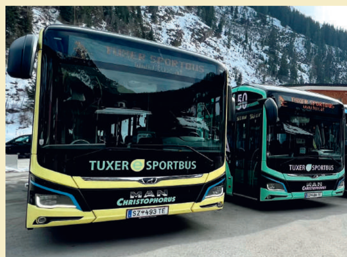
In Tux-Finkenberg, electric buses provide sustainable transportation throughout the valley.

Through regenerative braking and coasting, they recover energy while driving. „Up to 250 kW of energy can be fed back into the batteries in this way, enabling the buses to handle the sometimes demanding mountain routes without needing to recharge during the day,” reports Andreas Kröll of Christophorus Reisen. At night, the buses are recharged with green electricity at 400 kW superchargers. The use of electric buses saves around 450,000 litres of fossil diesel fuel each year, based on a total annual mileage of approximately 1,050,000 kilometres.