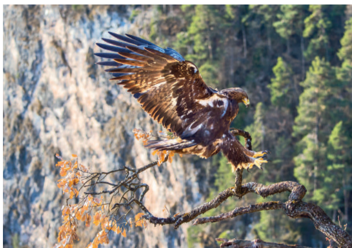
Golden eagles are not only a symbol of freedom, but also a valuable indicator of the health of alpine ecosystems.