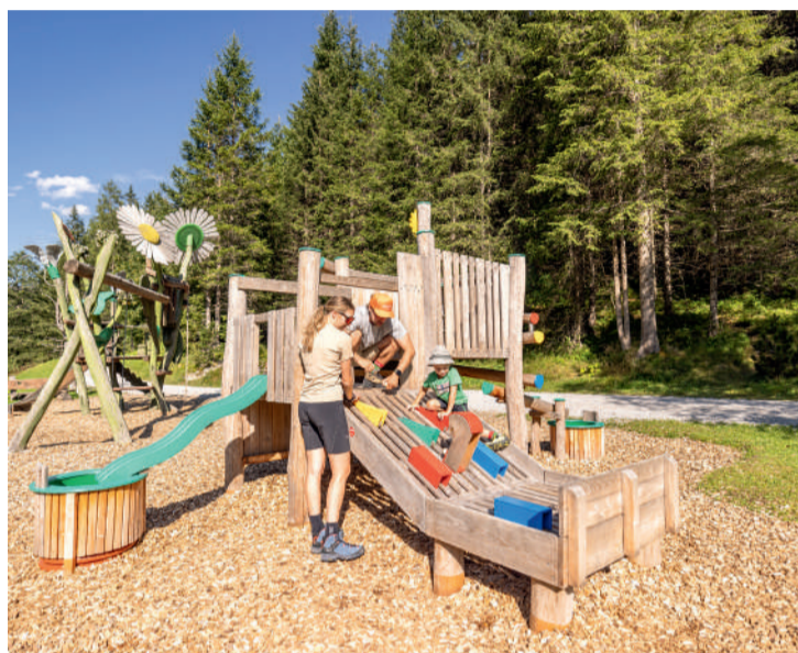
In Tux, the focus in 2026 will be on further development along the Tuxbach stream.

The reason for these measures was the flooding of the Tuxbach in July 2024, triggered by a thunderstorm cell over Junsberg and Madseitberg. The severe weather caused damage totalling around 2.3 million euros.