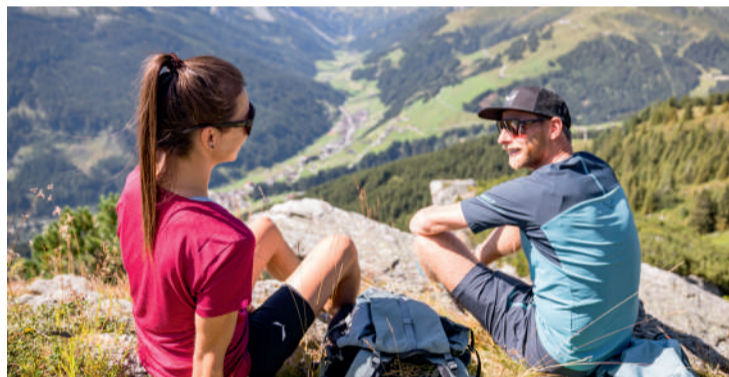
Tux-Finkenberg offers panoramic views, fresh mountain air, and a wide range of tours – from easy alpine hut walks to demanding summit ascents.

Summer in the Tux-Finkenberg holiday region is all about enjoying nature, staying active, and experiencing local culture. More than 350 kilometres of hiking trails and 150 kilometres of (e-)mountain bike routes lead to crystal-clear lakes, waterfalls and mountain summits – all framed by a spectacular alpine panorama. Three summer cable cars, a hiking taxi and the free Tux-Finkenberg shuttle make reaching the mountains easy and convenient.