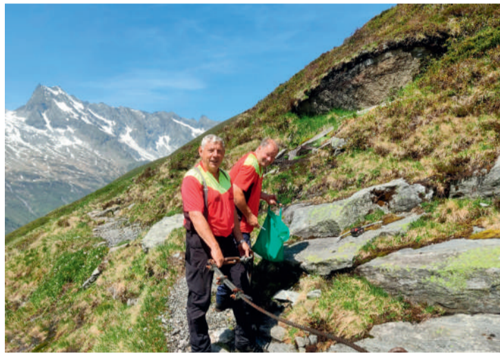
Employees walk the routes in pairs of at least two and document their condition. In some areas, comprehensive safety measures are also necessary.

GREAT COMMITMENT. In 2025, the ARGE trail teams completed more than 1,600 hours of work. Staff always inspect the routes