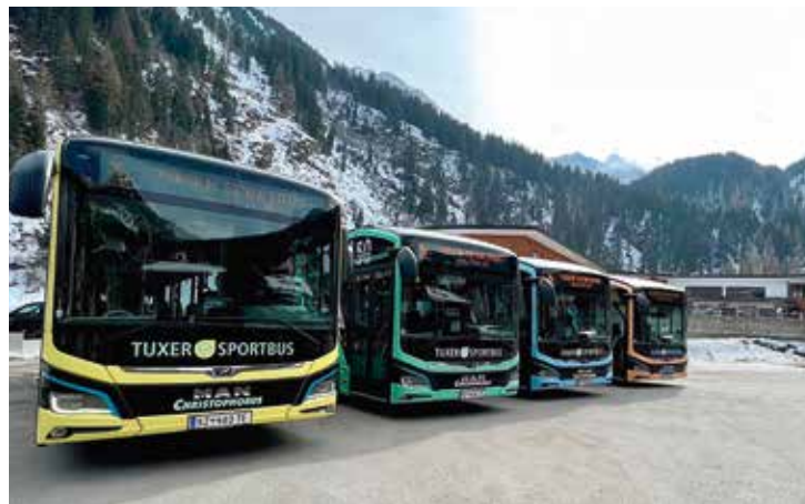
Electric buses ensure sustainable mobility throughout the valley in Tux-Finkenberg.

TUX (E)-SPORTBUS. Mobility is so much more than just getting from A to B – it's about responsibility: for the environment, for future generations, and for the preservation of the unique mountain landscape that makes the Tux Valley so special. The first four electric buses were introduced to the Tux Valley in March 2023. Since winter 2023/24, the highly frequent ten-minute-interval service has been operated using seven electric buses powered by clean, renewable energy. The battery-powered buses generate energy through regeneration while braking and coasting. Thanks to energy recovery of up to 250 kW, the energy demand per 100 km