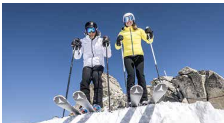
The Hintertux Glacier guarantees snow from October to May.

100% SNOW GUARANTEE. The Hintertux Glacier promises a unique winter adventure thanks to its altitude of up to 3,250 metres above sea level with the longest ski season in Austria. Winter sports enthusiasts can also enjoy 206 kilometres of perfectly groomed slopes in all levels of difficulty,