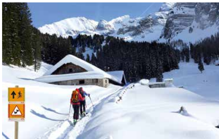
Alongside guided snowshoe hikes, the ski tour from Juns via the Loschboden to the Flach is one of the winter highlights of the High Alps Nature Park Zillertaler Alps.

HIDDEN TREASURES. For those seeking warmth between outdoor adventures, the Hidden Treasures